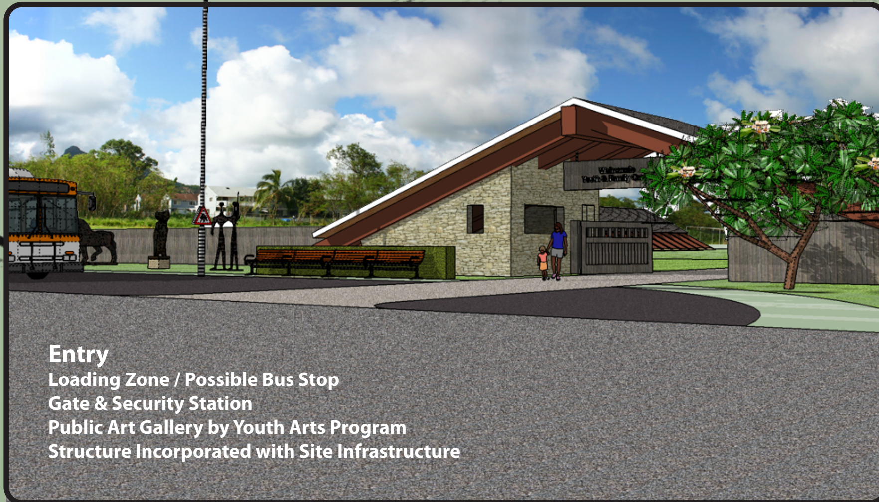
Entry Loading Zone / Possible Bus Stop Gate & Security Station Public Art Gallery by Youth Arts Program Structure Incorporated with Site Infrastructure